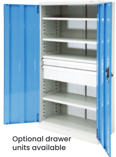
Optional drawer units available